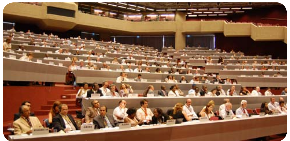
31 st Codex Alimentarius Commission, Geneva, Switzerland

a number; it's not a head count", she replied. "It's a spirit of agreement. Developing countries feel they're not