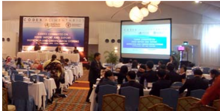
17 th CCFICS - Cebu, Philippines, from 24 th to 28 th November 2008