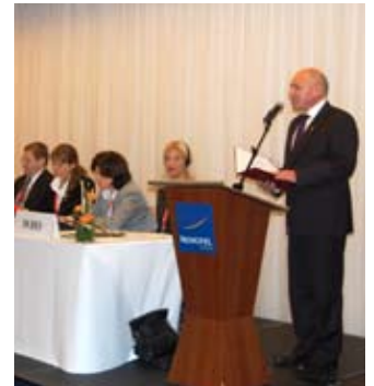
26 th CCEURO