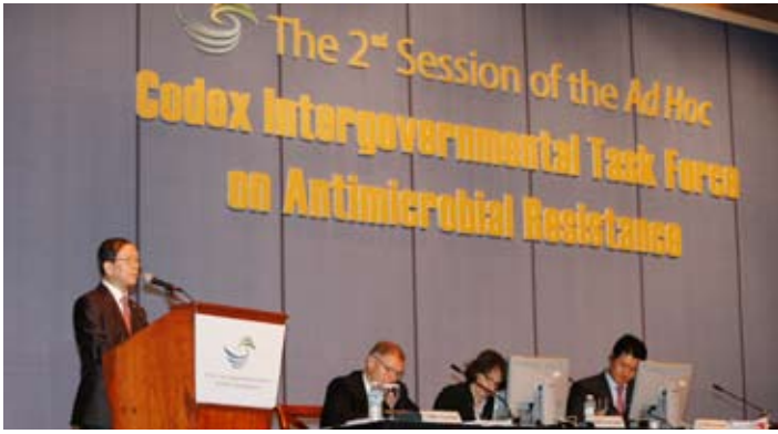
2 nd TFAMR - Seoul, Republic of Korea, from 20 th to 24 th September 2008