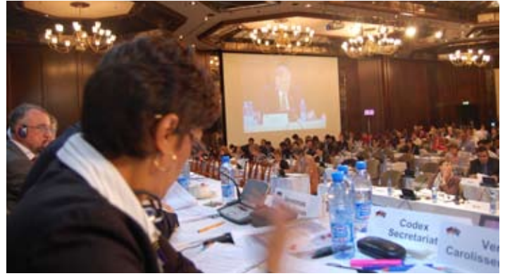
30 th CCNFSDU - Cape Town, South Africa, from 3 rd to 7 th November 2008