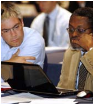
2 nd TFAMR