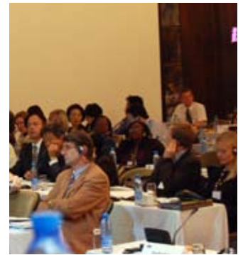
30 th CCNFSDU