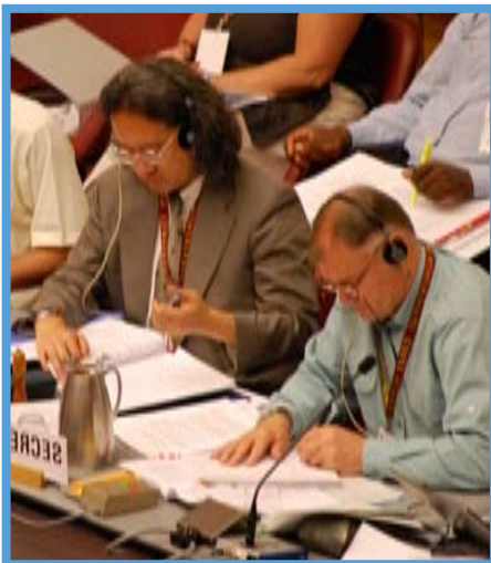
31 st CAC, Geneva, Switzerland