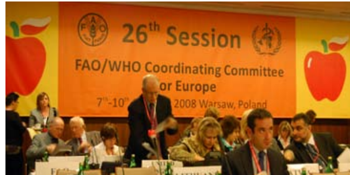
26 th CCEURO - Warsaw, Poland, from 7 th to 10 th October 2008