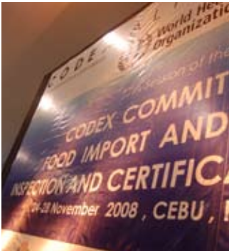
17 th CCFICS